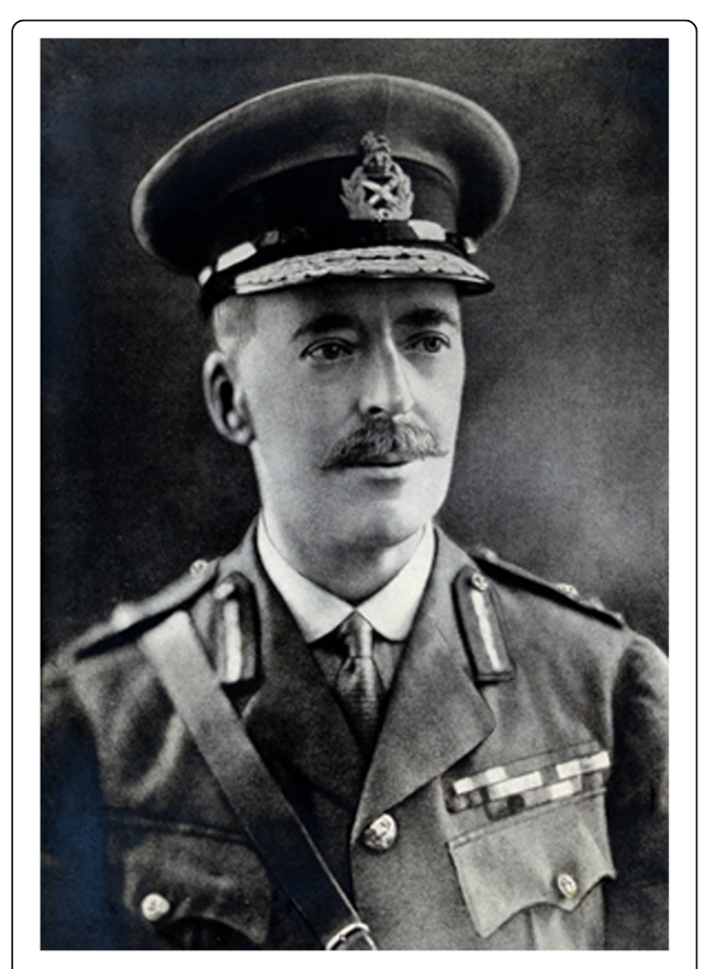
Fig. 1 Lieutenant General Sir William Boog Leishman. The genus Leishmania was named after the Scottish pathologist who is credited together with Charles Donovan for the discovery of the parasite that caused visceral leishmanioisi (VL).

In November 1900, the Scottish pathologist William Boog Leishman (1865–1926) (Fig. 1), who served with the British Army in India, discovered ovoid bodies in smears taken post-mortem from the spleen of a soldier who died from emaciation and splenomegaly while stationed at Dum